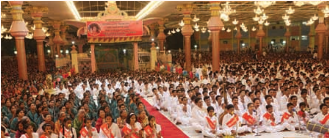
About 2,000 Bal Vikas alumni came to Prasanthi Nilayam to participate in Sri Sathya Sai Bal Vikas Alumni Meet on 7th November 2010.

presented two group songs captivating the entire audience with their melody and soulful rendition. The last item of the programme was instrumental music presented by 22 present Bal Vikas students. This was truly a divinely-inspired musical presentation which provided a virtual feast for the soul. At the conclusion of the programme, Bhagavan blessed the students and appreciated their performance. After distribution of Prasadam