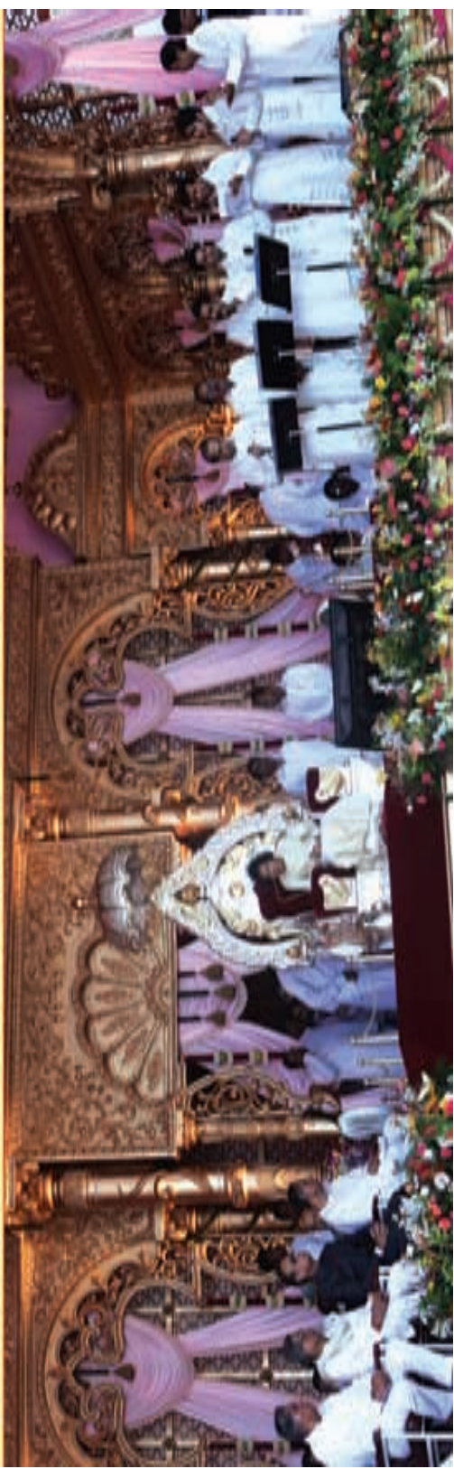
Grand 85th Birthday function of Bhagawan Sri Sathya Sai Baba in Sri Sathya Sai Hill View Stadium.