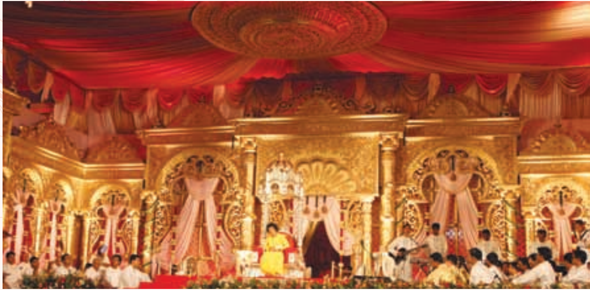
Bhagavan at enchantingly decorated Santhi Vedika while the students present the music programme "Prema Pravaham" on the evening of 23rd November 2010.

prophets of various religions on the Hanuman Hill as well as the giant statue of Hanuman at the top of the hill brightened the entire milieu. Added to this were laser beams emitting green light in mid-air. Moreover, brightly lit adjoining buildings of Institute's Administrative Block and Sanathana Samskruti Museum provided a charming background. The lighting on the ornamental golden-hued Santhi Vedika was simply mesmerising.