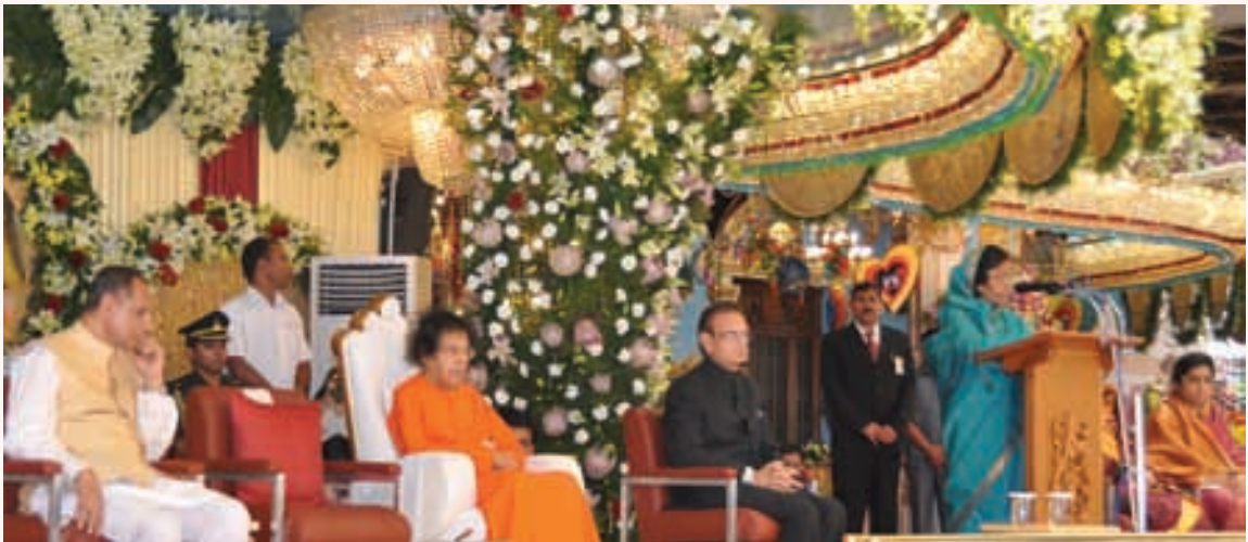
The President of India, Smt. Pratibha Devisingh Patil, speaking on Ladies Day celebrated at Prasanthi Nilayam in the Divine Presence of Bhagavan Sri Sathya Sai Baba on 19th November 2010.

Sai Institute of Higher Learning. The function began with singing of National Anthem soon after the arrival of Smt. Pratibha Devisingh Patil on the dais in Sai Kulwant Hall after 12.00 o'clock. Other dignitaries present on this occasion were Governor of Andhra Pradesh, Sri E.S.L. Narasimhan, Governor of Punjab and Administrator, Union Territory, Chandigarh, Sri Shivraj Patil, Minister