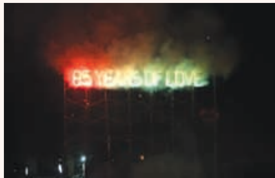
Deepavali, the festival of lights, became all the more glorious at Prasanthi Nilayam when a colourful display of fireworks was made in Sri Sathya Sai Hill View Stadium on 6th November 2010.

Veda chanting and Nadaswaram groups of students. Thousands of students lined the route of Bhagavan with lighted candles in their hands which presented a grand spectacle in the twilight hours of this auspicious day. On arrival at Santhi Vedika at 5.55 p.m., Bhagavan lighted the sacred lamp to inaugurate the programme. The display of fireworks and bursting of crackers started when Bhagavan pressed the remote controlled button. After this, various groups of students spread