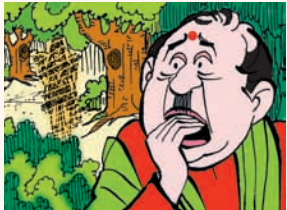
As the devotee looked back against the command of the goddess, he lost the great opportunity of possessing the jewellery of the goddess.

The devotee strode the way to his house with great joy and enthusiasm. He was in a great hurry as to when he would reach home and get all the jewellery of the goddess. After walking some distance, goddess Lakshmi