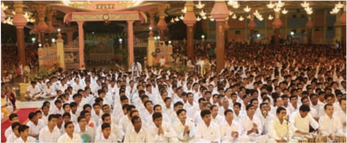
A section of devotees and students taking part in the Akhanda Bhajan held in Sai Kulwant Hall on 13th and 14th November 2010.

On the afternoon of 14th November 2010, Bhagavan came to Sai Kulwant Hall at 5.35 p.m. and showered His blessings on the