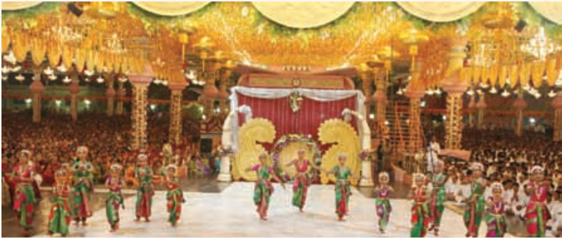
Students of Sri Sathya Sai Vidya Vihar, Hyderabad performed a vibrant dance on the occasion of Ladies Day on 19th November 2010.

concert with a superb rendering of “Vatapi Ganapatim Bhaje”, the talented singer followed it up with a judicious mix of classical pieces and popular songs which included a Mira Bhajan, “Pyare Darshan Deejo Aaj”. The concluding composition “Brahmamokkate Parabrahmamokkate” earned the enthusiastic response of the audience and provided a grand finale to this brilliant concert. In fact, the entire concert