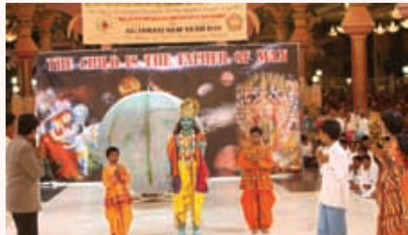
The drama "The Child is the Father of Man" showcased the purity and innocence of children which made them dear to God and earn His grace.