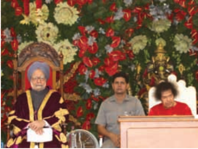
The Prime Minister of India, Dr. Manmohan Singh with Bhagavan at Prasanthi Nilayam.

renowned musicians and singers presented these programmes. They included Ustad Amjad Ali Khan and his sons Ayaan Ali Khan and Amaan Ali Khan, Sri Hariharan, Sri Suresh Wadkar, Sri Shankar Mahadevan, Sri Sikkil Gurucharan, Sri Abhishek Raghuram and Pandit Ronu Majumdar.