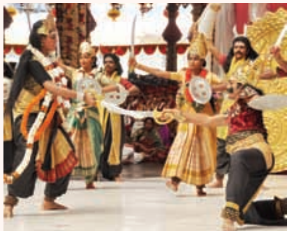
Bal Vikas children of Tamil Nadu performed a dance drama "Mahishasura Mardini" as part of Ladies Day celebrations at Prasanthi Nilayam.

These talks were followed by a vibrant dance drama entitled "Mahishasura Mardini" (annihilator of demon Mahishasura) by Bal Vikas children of Tamil Nadu. The drama