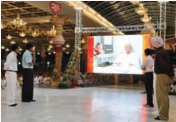
On the occasion of the international conference on "Cardiovascular Diseases – the Sathya Sai Model", a cultural programme entitled "To Be is to Serve" was presented in Sai Kulwant Hall.

A cultural programme entitled "To Be is to Serve" was presented in Sai Kulwant Hall on the evening of 25th October 2010 which was watched among others by the delegates to the conference. It showcased