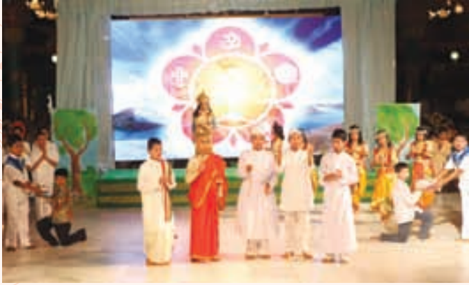
As part of Bhagavan's 85th Birthday celebrations, the students of Sri Sathya Sai Primary School, Prasanthi Nilayam presented an excellent drama on 18th November 2010.

troupe. Meanwhile, a melodious song on the public address system offered welcome to Bhagavan. The drama commenced after Bhagavan was seated on the dais. It depicted the teachings of Bhagavan on the unity of all religions through presentation of the teachings of prophets and saints of all major religions of the world. By portraying the story of Upamanyu and Uddhava's dialogue with Gopikas of Brindavan, the drama highlighted the path of Bhakti as the easiest path for man's redemption. Embellished with beautiful songs and excellent dances of the students and supported by innovative use of video presentation of the relevant scenes and incidents, the drama was a grand success. Good choreography, excellent costumes and make-up added beauty to the drama. The drama which began at 7.00 p.m. came to a close at 7.50 p.m. with a sweet song on the glory of Bhagavan. At the conclusion of the drama, Bhagavan blessed the students, provided them the coveted opportunity of a prolonged photo session with Him and distributed clothes to them. The programme came to a close with Arati to Bhagavan