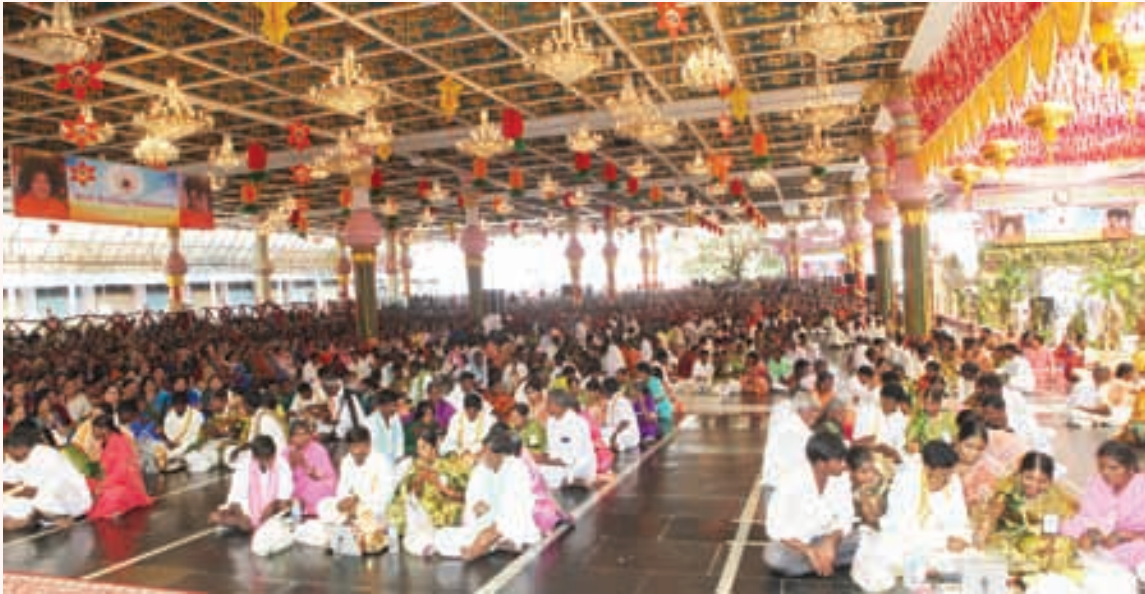
In a mass marriages function held on 17th November 2010 in Sai Kulwant Hall, 95 mass marriages were performed as part of 85th Birthday celebrations of Bhagavan.

Hindu marriage threads) and the organisers distributed them to the bridegrooms which they had to tie around the neck of their respective brides, marking the completion of the marriage. At the auspicious time of 11.59 a.m., the bridegrooms tied the Mangal Sutras around the necks of their respective brides while the priest chanted the relevant