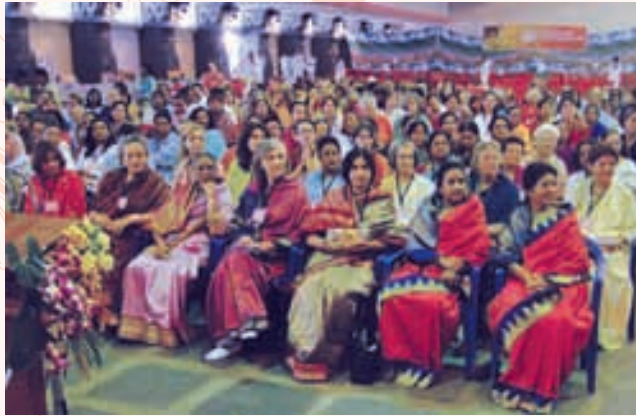
A section of the delegates to the 9th World Conference of Sri Sathya Sai International Organisation held in Poornachandra Auditorium on 20th and 21st November 2010.