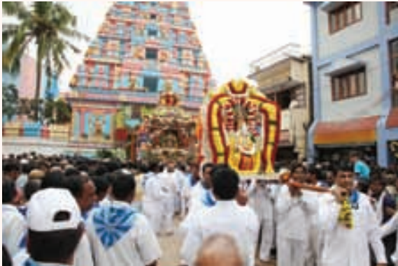
The sacred festival of Rathotsavam was held on 18th November 2010.

The sacred festival of Rathotsavam held every year on 18th November marks the auspicious beginning of Bhagavan's Birthday festivities. It is followed by Ladies Day on 19th November, Institute's Convocation on 22nd November and culminates in Birthday