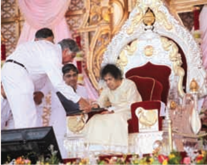
Sri Ratan Tata presenting the software to Bhagavan for launching the new project "Sri Sathya Sai Vidya Vahini" on 23rd November 2010.