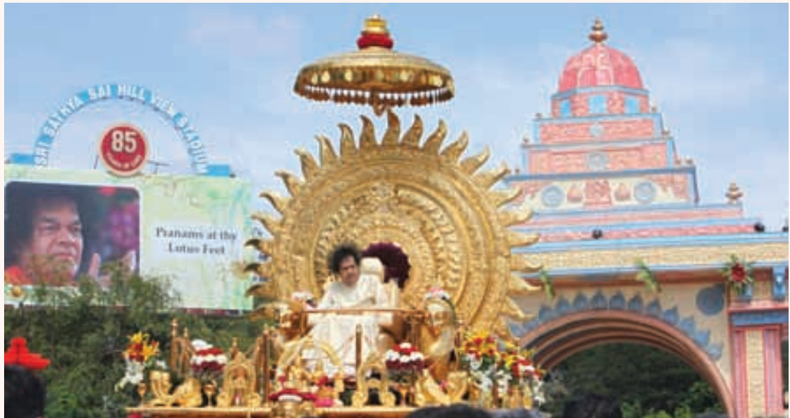
Bhagavan came to Sri Sathya Sai Hill View Stadium in a grand procession on a resplendent golden chariot on the morning of 23rd November 2010.

Clad in a sparkling golden white robe, Bhagavan came in a grand procession to the stadium on a golden chariot at 11.25 a.m. A large contingent of musicians, Veda chanting students and bands of schools and colleges formed part of the colourful procession. A galaxy of renowned singers sang a sweet welcome song, "Swagatam, Shubh Swagatam, Shubh Swagatam Bhagavan" as Bhagavan entered the stadium. They included Sri Shankar Mahadevan, Sri Hariharan,