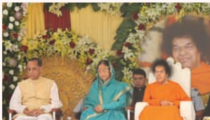
The President of India, Smt. Pratibha Devisingh Patil and the Governor of Andhra Pradesh, Sri E.S.L. Narasimhan with Bhagavan in Sai Kulwant Hall, Prasanthi Nilayam.

Minister, Sri S.M. Krishna, Union Minister of Heavy Industries, Sri Vilasrao Deshmukh, Union Minister of Power, Sri Sushilkumar Shinde, Union Minister of Steel, Sri Virbhadra Singh, Governor of Punjab and Administrator, Union Territory, Chandigarh, Sri Shivraj Patil, Governor of Andhra Pradesh, Sri E.S.L. Narasimhan, Chief Minister of Andhra Pradesh, Sri K. Rosaiah, Chief Minister of Karnataka, Sri B.S. Yeddyurappa, Chairman of Tata Group of Industries, Sri Ratan Tata, Chairman of TVS Motor Company, Dr. Venu Srinivasan, Andhra Pradesh Minister of Tourism and Information and Public Relations, Dr. (Smt.) J. Geeta Reddy, Deputy Chief Minister of Tamil Nadu, Sri M.K. Stalin, former Chief Minister of Maharashtra, Sri Ashok Chavan, and a large number of other prominent persons.