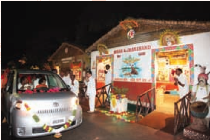
Bhagavan came to Sri Sathya Sai International Centre for Sports to see the exhibition on Sri Sathya Sai Village Integrated Programme on 16th November 2010.

Nilayam, an exhibition was set up in Sri Sathya Sai International Centre for Sports (Indoor Stadium) from 15th to 24th November. The exhibition depicted the service activities of Sri Sathya Sai Seva Organisations of various States of India under Sri Sathya Sai Village Integrated Programme and service activities of Sai Organisations of various overseas countries. Bhagavan came to see the exhibition on 16th November 2010. The exhibition contained one pavilion each of all the States of India, showing their service activities in the area of healthcare, education, tree plantation, Grama Seva, Narayana Seva, flood relief, disaster management, etc. There was a separate pavilion of the Technology Group which depicted organic farming, economical housing, water purification, solar energy, biogas energy, etc. The overseas pavilion showed the activities being undertaken by overseas countries like medical camps, disaster relief, water projects, healthcare, etc. Music and cultural programmes were organised daily during the course of the exhibition which depicted