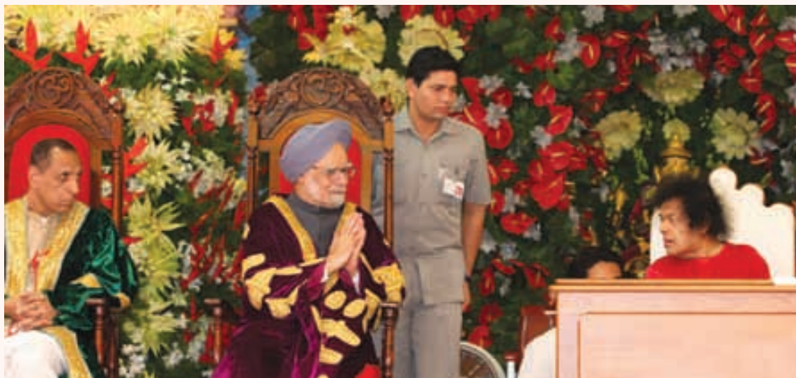
The Prime Minister of India, Dr. Manmohan Singh, the Chief Guest of the 29th Convocation of Sri Sathya Sai Institute of Higher Learning with the Chancellor of the Institute, Bhagavan Sri Sathya Sai Baba in Sai Kulwant Hall, Prasanthi Nilayam. On the right side of the Prime Minister is the Governor of Andhra Pradesh, Sri E.S.L. Narasimhan.