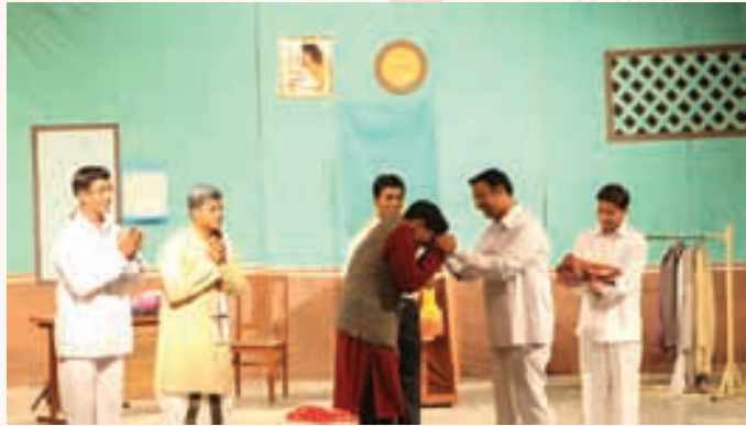
A scene from the Convocation Drama presented by the students of Sri Sathya Sai Institute of Higher Learning on 21st November 2010.

ordinary tailor whose earnestness in his profession and unswerving devotion to Lord Vitthala earned him the deservedness to attain the grace of the Lord who manifested before him and came to his rescue at a critical juncture in his life. The episodes of Sakkubai and Emperor Alexander befittingly reinforced this truth. Dexterous handling of the simple story made the drama very absorbing and kept the viewers glued to their seats during