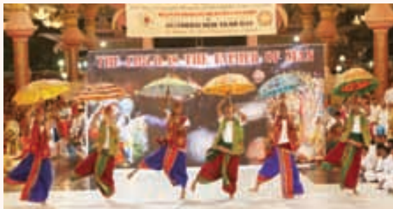
The youth of a village named Rajupura adopted by Sri Sathya Sai Organisation of Gujarat presented a folk dance on 5th November 2010.

The first item of the programme was a vibrant folk dance presented by the youth